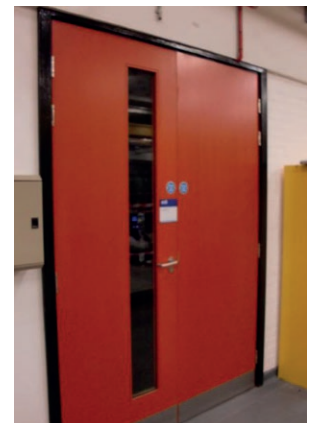
OLD Timber Door

The task of taking out the old timber fire doors and replacing the door with steel flood - fire doors with fire ratings, was undertaken and completed within 1 day.